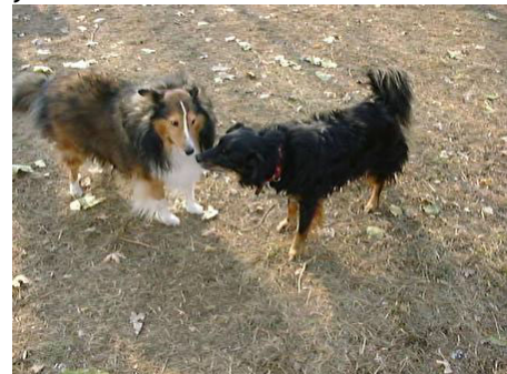
Sheba & Pepper see eye to eye now!

Let's work together to make our leash free area a success