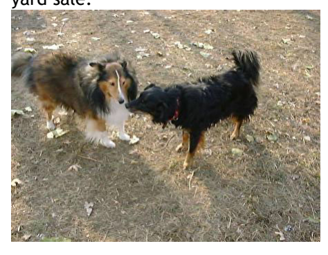
Sheba & Pepper see eye to eye now!

Early in the spring, we will be having a GIGANTIC yard sale in the Quinte Computer parking lot. We will be asking all our members for donations to this yard sale.